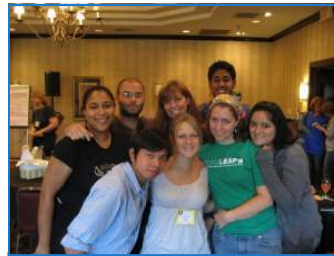
Our newest VISTAs at July PSO

Our newest VISTA members come to us from across the country and the state of Texas.