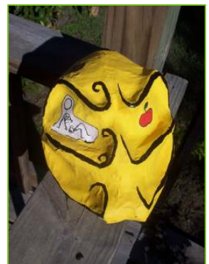
Muerte y Manzana en Amarillo y Negro como las Abejas Siniestros (Death & Fruit in the Sinister Yellow-and-black of Bees)

Continues on page 4, see My New Community